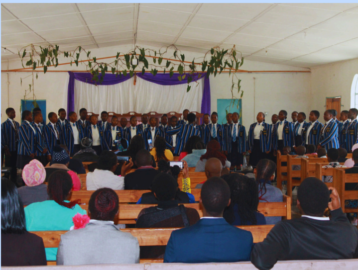
Milestone College Choir at Mabvazuva Church

This term, the Milestone College Choir had the privilege of fellowshipping at Mabvazuva Church, where they shared their musical gifts with the congregation.