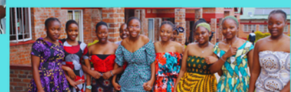
Milestone College Africa Day 2025

We extend our sincere appreciation to parents for their unwavering support in ensuring that students were appropriately dressed, contributing to the success of this memorable day