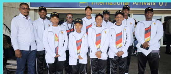
Robotics Club returns from the USA

Her exceptional talent and dedication earned her a prestigious $2,353 award, a testament to her outstanding academic and scientific abilities