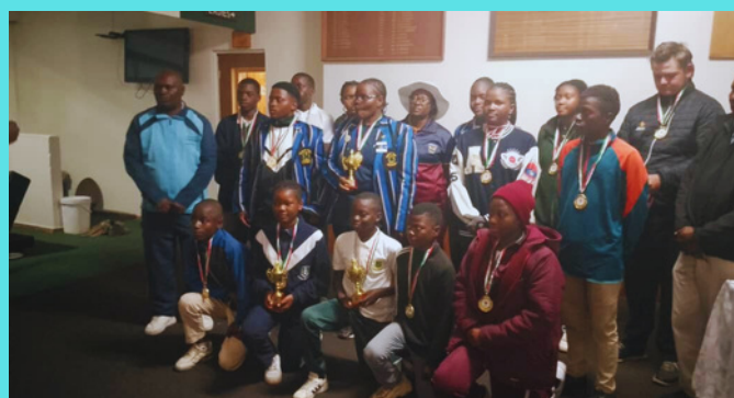
Manicaland Provincial golf team

By fostering participation and interest in the sport, the program encourages young athletes to develop their skills and compete at higher levels.